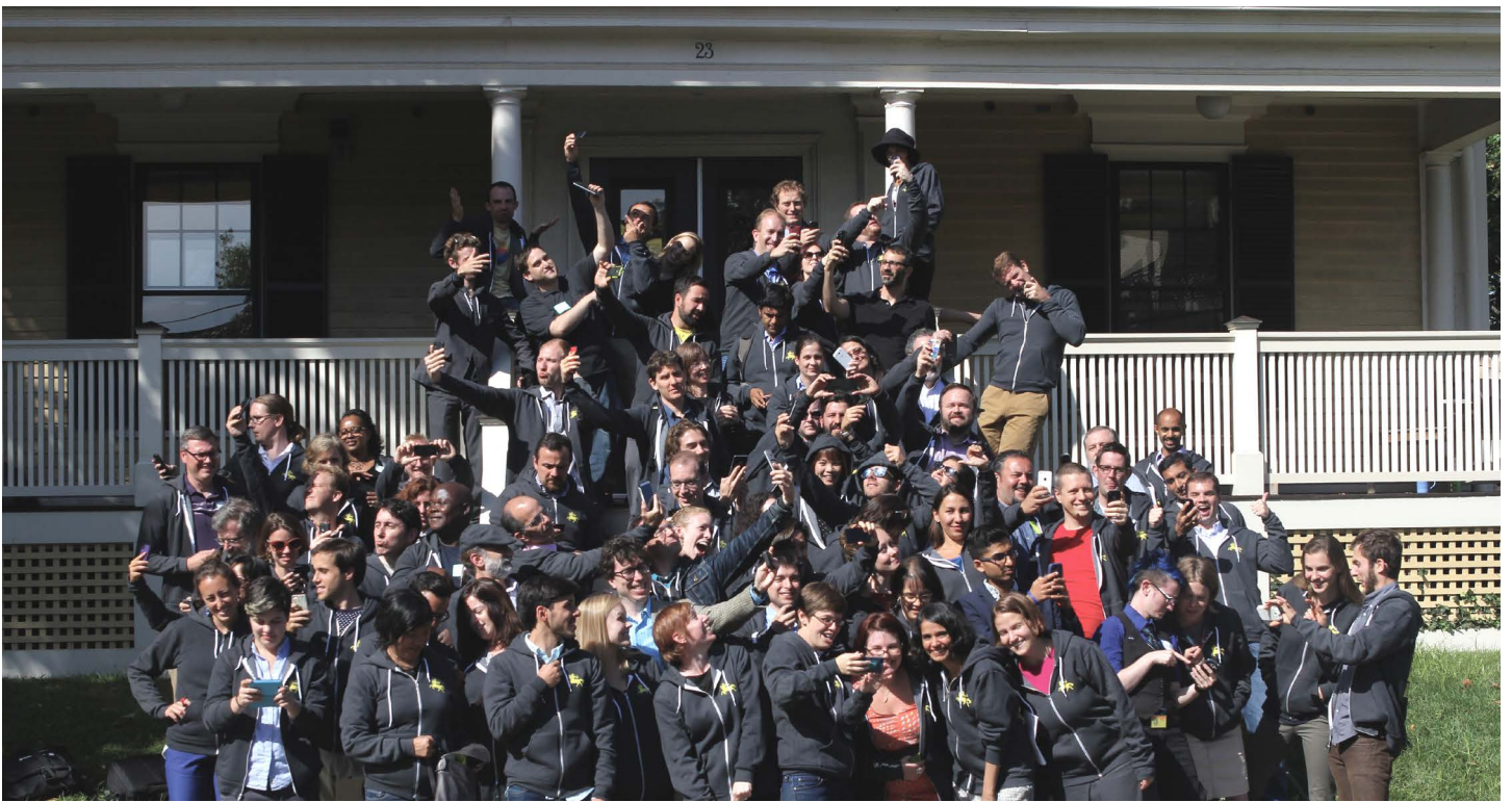
A small sample of the 2014-2015 class of Berkman fellows, community, interns, staff, and directors take a group selfie