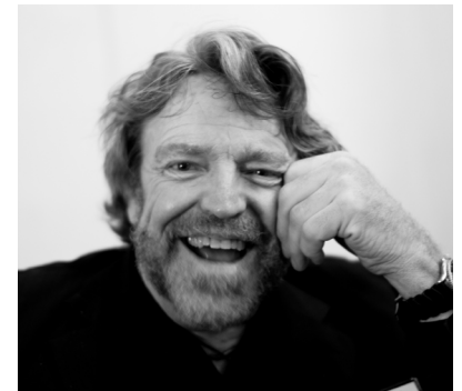
John Perry Barlow, the inaugural Berkman fellow