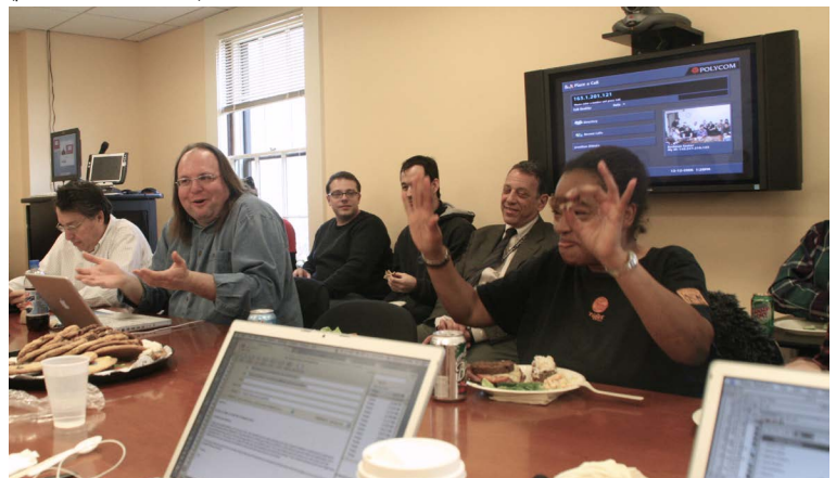
Guests, both in-person and remote, enjoying the Berkman Tuesday Luncheon series event