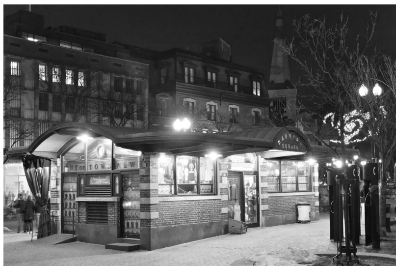
Harvard Square, in winter. Most Berkman fellows are expected to be Cambridge-accessible for the duration of their fellowship

The staff does an initial, thorough review of the applications,