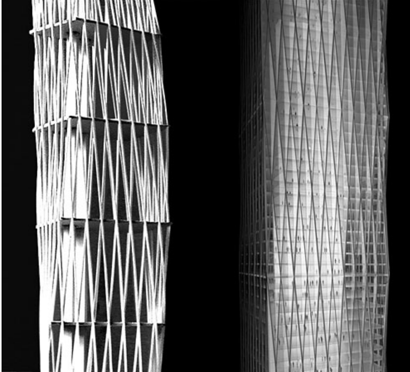
Childs, Freedom Tower